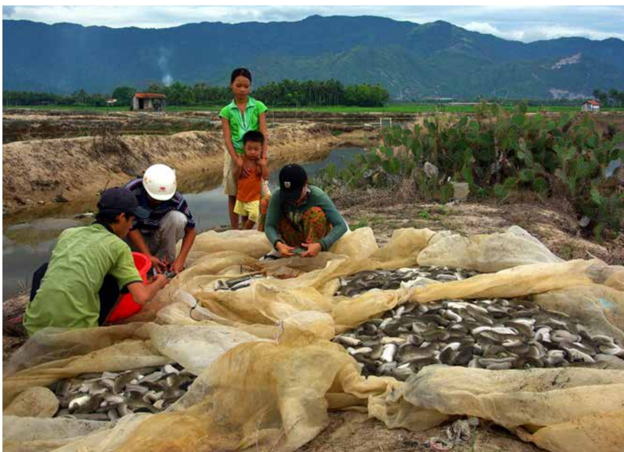
A project in Vietnam and the Philippines aims to increase technical skills in culture methods of sea cucumbers to increase production capacity and expand community-based sea cucumber farming. Photo: ACIAR. ACIAR project: FIS/2016/122.

A new project in 2020–21, with activities in Indonesia and Vietnam, will underpin good plant biosecurity practices in forestry. With government and industry partners, the project led by Dr Caroline Mohammed of the University of Tasmania, will extend screening approaches from prior Acacia/Ceratocystis research to eucalypts that have replaced acacias in the wet tropics; develop remote-sensing software applications for cheap and rapid forest health surveillance; and, through geospatial modelling, deliver establishment (suitability and survival) risk maps under current and future climates at a regional level for the highest priority pests and pathogens. 16